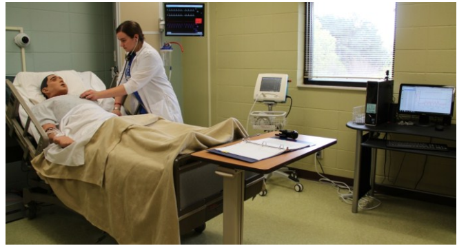
Figure 1. Training session in the Real-time Physiological Monitoring Lab

We used a control room with a one-way mirror and a private patient room equipped with high fidelity simulator, functional headwall, state of the art physiological monitors, and audio and video monitoring systems. From the control room, we ran the simulated nursing activity, and using our custom software synchronously recorded the activity of the participant from a video camera and their physiological signals from a Zephyr BioHarness 3, placed as chest belt [25]. All records of the physiological signals are automatically uploaded to the research server. The records contain interbeat intervals, heart rate, breathing rate, and acceleration on chest belt. BioHarness samples ECG at 250Hz and on-belt accelerometer at 100Hz. A nursing student during a training session on the high fidelity patient simulator in the Real-time Physiological Monitoring Lab is shown on the Figure 1.