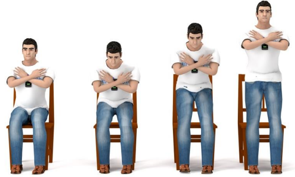
Figure 2. 30 Second Chair-Stand (30SCS) test phases

test [7]. The complete set of parameters for each cycle of the 30SCS test is shown in Table II. The 30SCS smartphone application begins the test when a subject presses ‘Start’ button on the screen. Then the subject makes as many stand-ups as he/she can during 30 seconds; the application makes an acoustic cue (beep sound) after 30 seconds to indicate the test completion. Our application counts the total number of stand-ups as well as total number of complete cycles (stand-up to sit-down). The application displays important parameters immediately on the screen after the completion of the test as shown in Figure 4 (middle). The values of parameters listed along with the raw signals of the test are saved in the .csv file on the smartphone as well as uploaded on the mHealth server for further analysis.