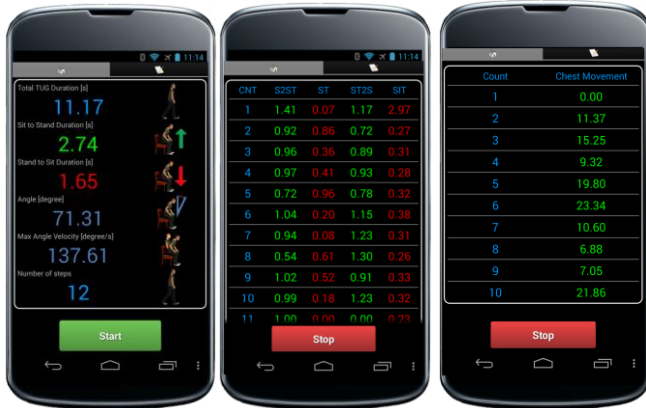
Figure 4. Smartphone applications screens for sTUG, 30SCS and 4SBT.