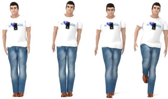
Figure 3. The 4-stage balance test feet positions

The 4SBT smartphone application consists of four tests that can be selected using the test selector screen. The application starts the test after the user presses ‘Start’ button on the display screen. The 4SBT tests provide the average chest movements during each of the four positions of the balance test. The application uses accelerometer signals to quantify relative displacement of the chest producing parameters described in Table III. The chest displacement values indicate the balance control of the subject. The lower displacement values demonstrate better stability during the tests.